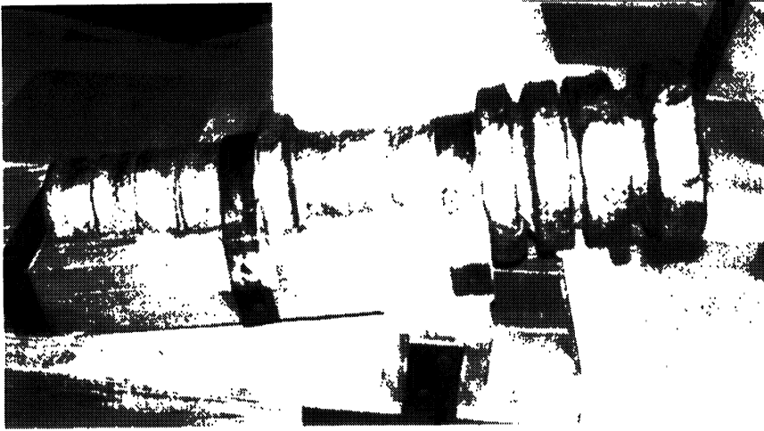
Small early bombard, in the collection of the Army History Museum in Vienna. The long section on the wooden base is the powder chamber; the wider section forward of that is the barrel. Note the shortness of the barrel, which has an internal length only about 1.5 times its diameter.

prepared for the siege of Saint-Saveur-le-Vicomte in 1375 fired stone shot of a hundredweight, and Froissart records the use of a gun firing 200-pound stones two years later. The Count of Holland purchased 400-pound stones for his “grooten donrebusse” in 1378. 83 Two bombards purchased by the Duke of Burgundy in 1409 hurled stones of 700–750 and 800–950 pounds. 84 Faule Mette , cast circa 1411, fired stones of over half a ton. The massive Pumhart von Steyr , forged c. 1420, fired an 80-cm stone weighing over fifteen hundred pounds . 85